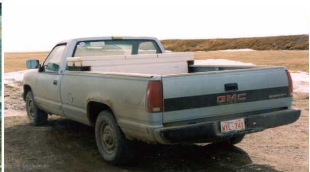
Photographs #2 and 3-

These photographs show the pickup truck used and a close up of the rear bumper where the hitch ball was attached.